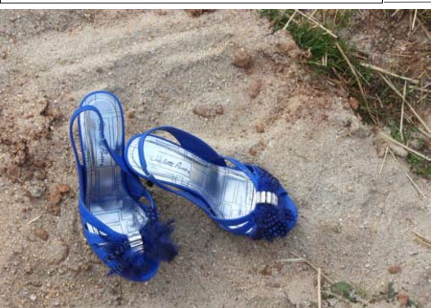
"I Do" by Danylle Cupp Graduating Photography Student